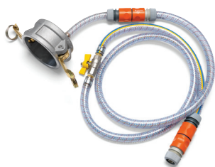
HARNESS 510 28 00-01