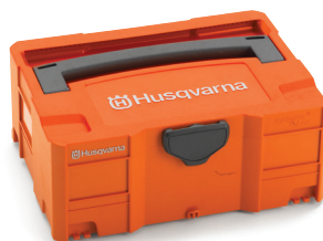
TOOL BOX 501 68 51-01