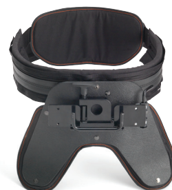
HARNESS BELT FOR REMOTE CONTROL UNIT 501 79 31-01