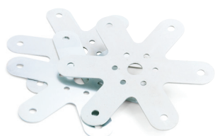
FLEXIBLE GRINDING HEAD SPRINGHUSQVARNA RESIN HOLDER STEEL REPLACEMENT 502 53 42-01