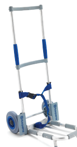
TRANSPORT TROLLEY 501 68 51-02