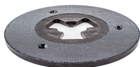
HR 820 HEAD, FOR HEAVY REMOVAL AND PREPARATION 502 53 38-01