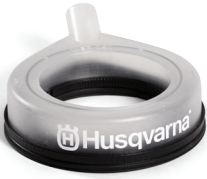
SLURRY RINGS WSR 593 56 30-05