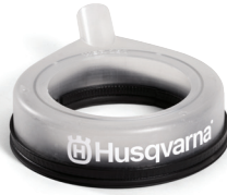
SLURRY RINGS WSR 593 56 30-06