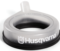
SLURRY RINGS WSR 593 56 30-02