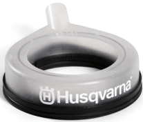
SLURRY RINGS WSR 593 56 30-01