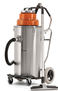
HUSQVARNA W 70 P 967 66 47-04