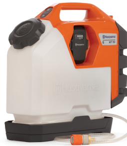
HUSQVARNA WT 15I 599 58 23-02