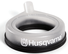
SLURRY RINGS WSR 593 56 30-04