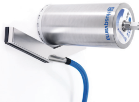
SLURRY COLLECTOR V-SHAPED 531 28 00-07