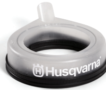
SLURRY RINGS WSR 593 56 30-03