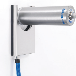
SLURRY COLLECTOR 531 28 03-29