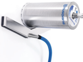
SLURRY COLLECTOR V-SHAPED 531 07 46-22