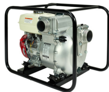
Semi Trash Pumps