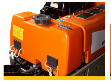
Built-in Water Tank