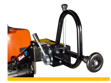
Handle Push Stop