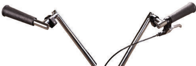
HD7070 handles can be adjusted for height, twisted to the inside or outside and have the angle adjusted.