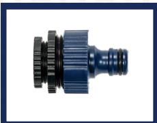
3. Tap Adaptor