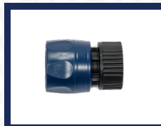
5. Quick connect stop valve hose fitting