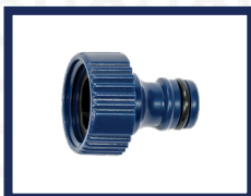
4. Screw on quick connect hose fitting