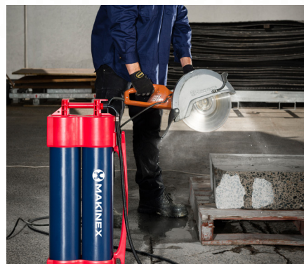
3. Connects with Coring and Cutting Tools

Auckland, Head Office 6-10 Parkway Drive, Mairangi Bay, Auckland (+64) 09 443 2436 sales@yrco.co.nz