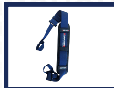
6. Shoulder Strap attachment