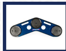
6. Glass Sucker