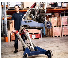
2. Solo Lift to 140KG