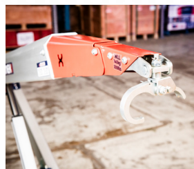
4. Auto Closing Hook