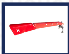
4. Nose Extension