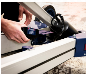
1. Battery Powered