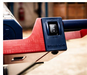
5. Switch Operated Height Adjustment

Auckland, Head Office 6-10 Parkway Drive, Mairangi Bay, Auckland (+64) 09 443 2436 sales@yrco.co.nz