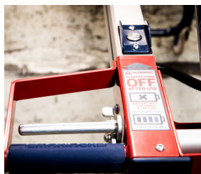
3. Hand Brake and Button Start