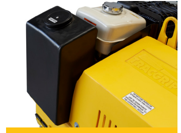
Non-corrosive Water Tank