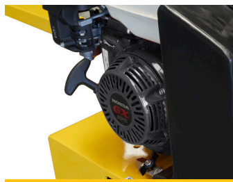
Powered by Honda GX270