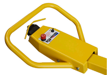
Handle Control / Dead Man