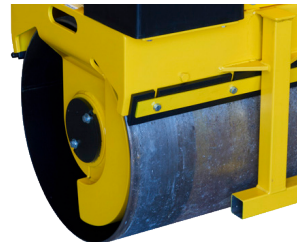
Chamfered Roller Edge