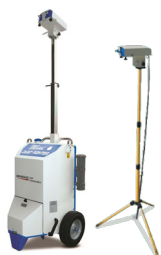
DF Duo Mini