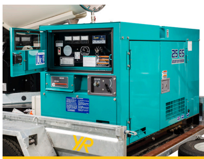
Self Contained Power