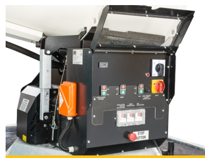
Simple Control Panel