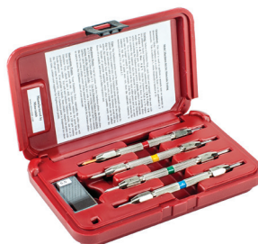
HARDNESS TEST MOH'S TEST KIT 593 31 69-01