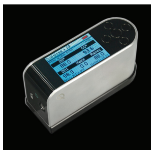
GLOSS & DOI METER RHOPOINT IQ 593 31 15-01