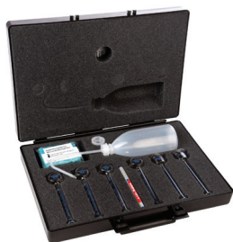
PENETRATION TEST KARSTEN PIPE TEST KIT 598 85 80-02