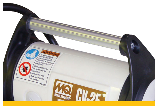
Vibration isolated handles