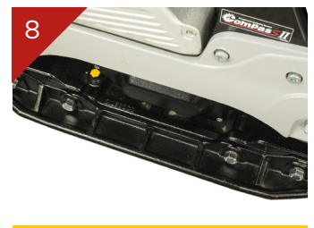
Removable Extension Plates Excludes: MVHR60HA, MVH128, MVH158