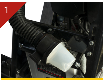
Cyclone Air Cleaners

Easi-load Tilt-deck Trailers. Custom tilt trailer to suit Mikasa Reversing Plates.