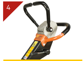
Variable Speed Controls