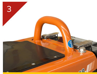
Sturdy Lift Frame