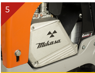
Enclosed Belt Guard