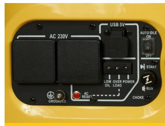
USB Ports & 12V Charger