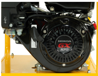
HONDA GX Engine