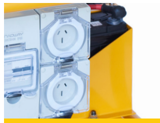
IP66 Rated Plug Sockets