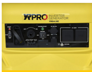
Easy Use Control Panel