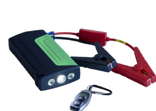
Portable Battery Pack, Jumper Leads and Remote Start