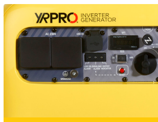
Easy Use Control Panel