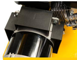
IP23 Rated Alternator