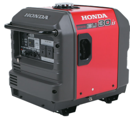
EU30IS (Optional lifting frame and wheels)