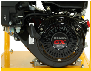
HONDA GX Engine