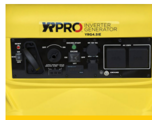
Easy Use Control Panel