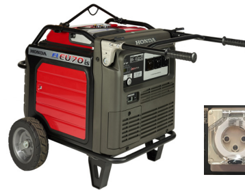
EU70IS (Optional lifting frame)