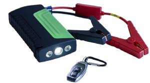
Portable Battery Pack, Jumper Leads and Remote Start