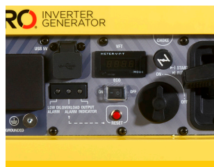
2 x USB Ports