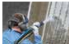
8.6 to 10 bar: Abrasive blasting