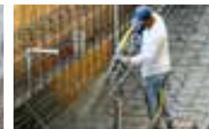
7 to 12 bar: Shotcrete applications