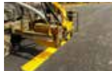
5 bar: Road line painting