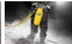
7 bar: Handheld tools