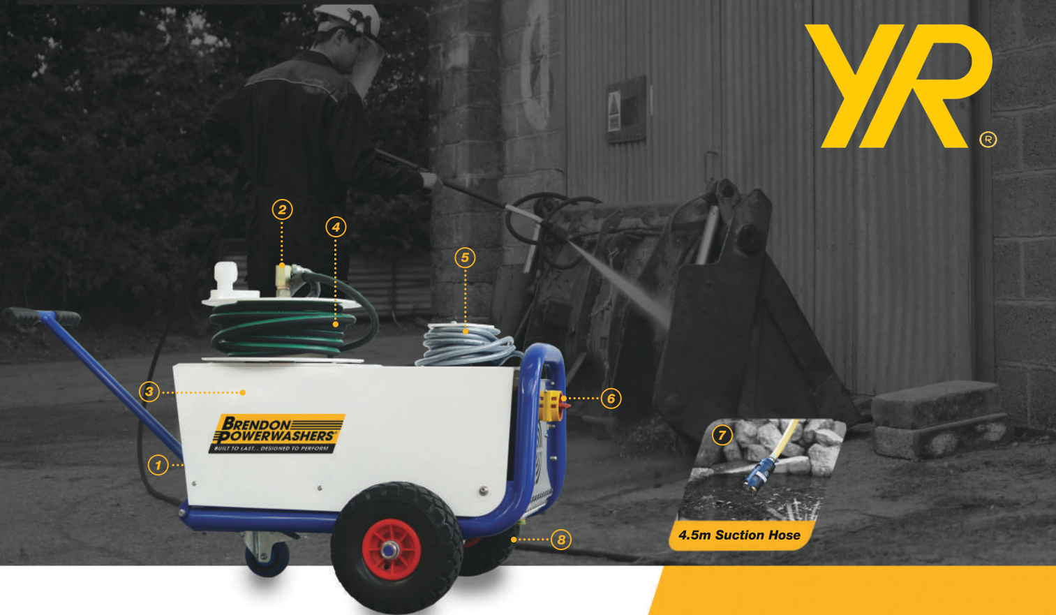
4.5m Suction Hose