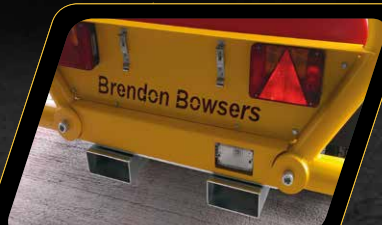
Optional Extra: Rear Forklift Points