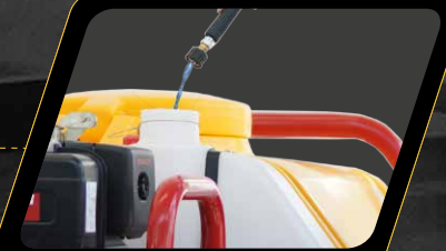
Integral Anti-Freeze & Detergent Tanks