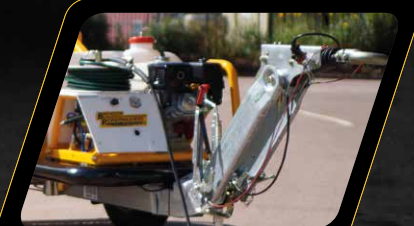
Choice of 50mm Ball or Eye couplings - Alko Adjustable Hitch available