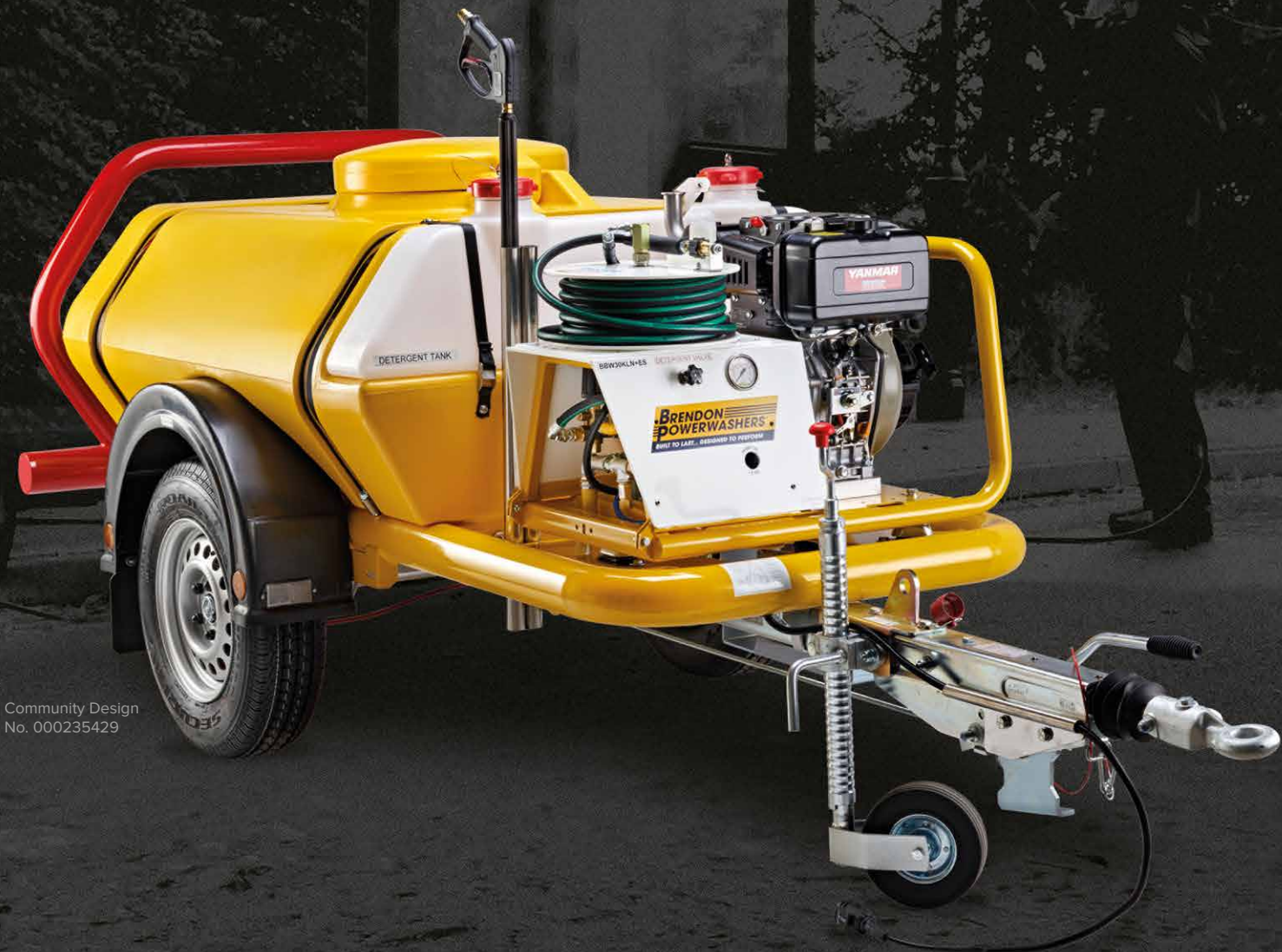
Community Design No. 000235429

Brendon Powerwashers launched its' ground breaking Bowserwasher range early in the new Millennium. Our innovative Bowserwasher fast-tow trailer has proved a great success in many markets especially the tough and competitive Rental and Construction sectors. With thousands of machines sold Worldwide demand for the Brendon range of machines keeps growing. Join us to discover just some of the many advantages and options available.