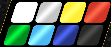
Large choice of Tank & Chassis Colour Combinations