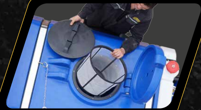
Lockable Hinged Tank Lid with removable Basket Filter