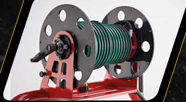
Optional Extra: Manual or 12V DC Electric Hose Reels for 30M - 100M of HP Hose