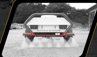
Optional Extra: Rear mounted spray bar for dust suppression