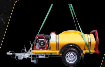
3 Point Lifting Points