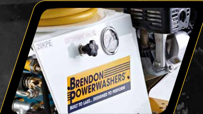
Polypropylene Canopy with Detergent Control Valve and Pressure Gauge