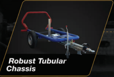
Robust Tubular Chassis