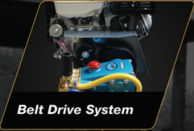
Belt Drive System