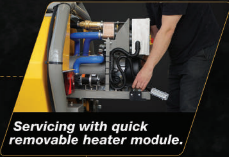
Servicing with quick removable heater module.