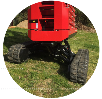
Named after the ancient Greek goddess of wisdom and strength, Athena was named for its clever bi-levelling capacity.

The Athena Bi-Energy range combines powerful thermic engine and Lithium Battery and is ideal for both outdoor and indoor applications that demand low noise and clean performance, such as construction sites, sports arenas, shopping and parking malls, facilities, and even challenging pedestrian areas.