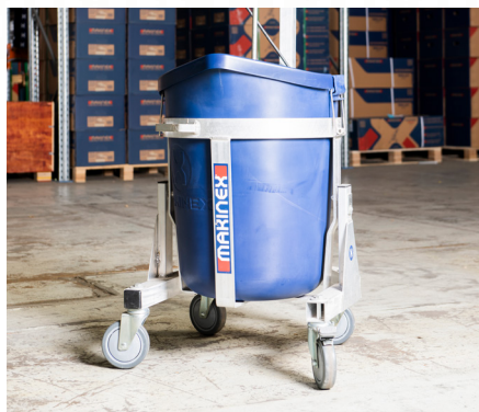
1. Mixing Station MS100