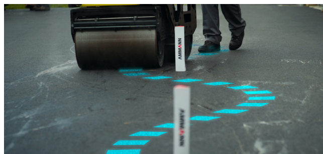
AWR 65-S Walk-Behind Roller with 15° steering angle